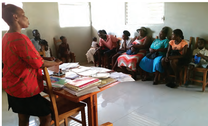
Devotions are hosted daily at our medical clinic in Haiti—because we believe the Gospel changes lives forever.