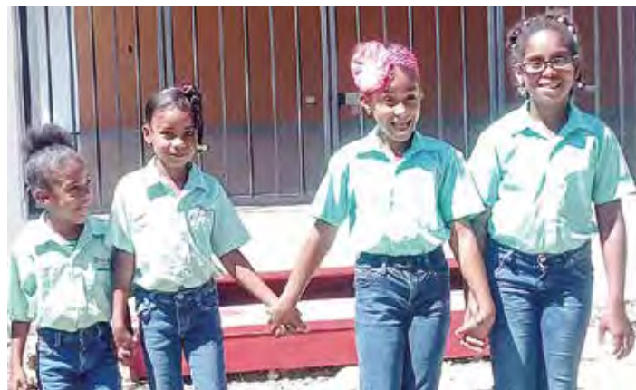
Join us in prayer for the children of Los Castillos, as they grow in knowing Jesus.