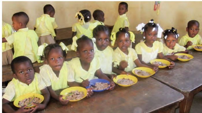
Students from New Missions Christian Academy in Haiti enjoy lunch at school.