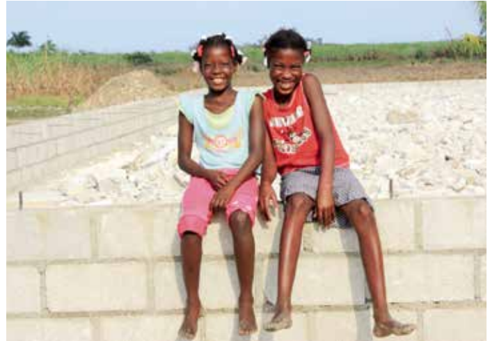
When we build churches we build better futures for generations to come.