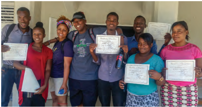
Congratulations to our school administrators on receiving their CPR certifications.