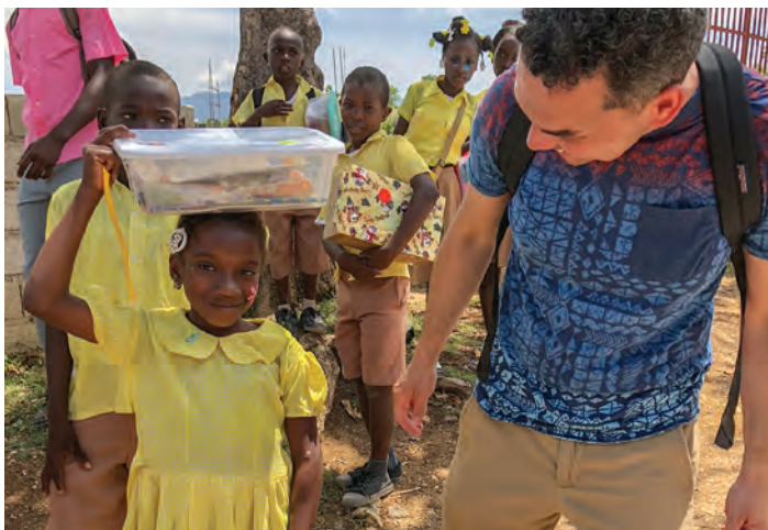
Giving shoebox gifts while on a mission trip is an experience that lasts a lifetime.