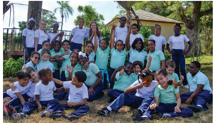
Our schools are places where students from different countries and backgrounds learn together and some even become best friends.