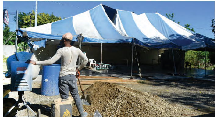
Workers are laboring six days a week to finish the pavilion before Christmas activities begin.