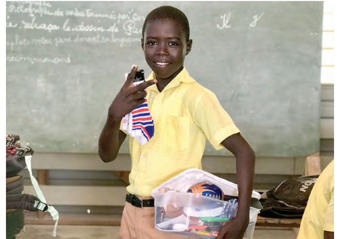
From socks to school supplies, each shoebox is a big deal to our students.