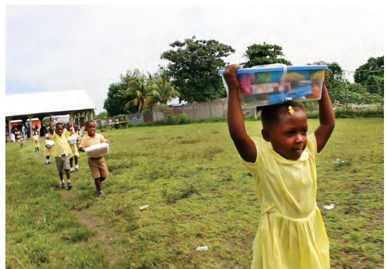
Bottom left: There's plenty of time to collect shoebox gifts because our collection runs through Dec. 31, 2018.