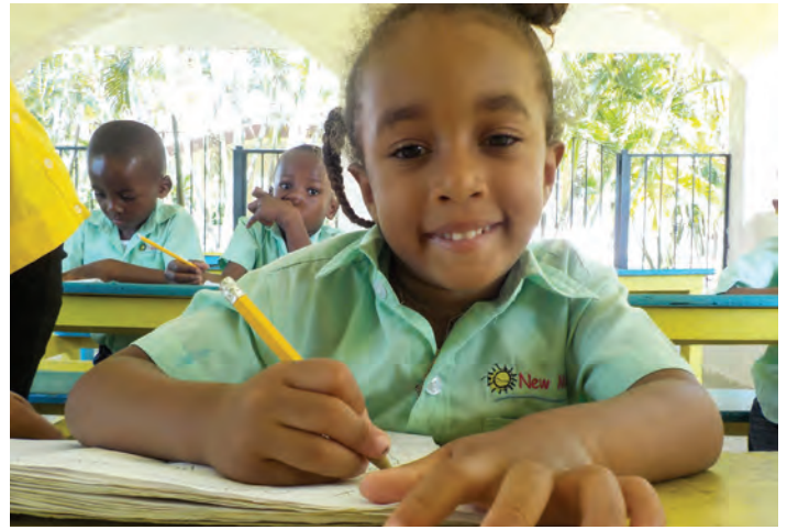
Thank you for giving to the I Am Hope Club.