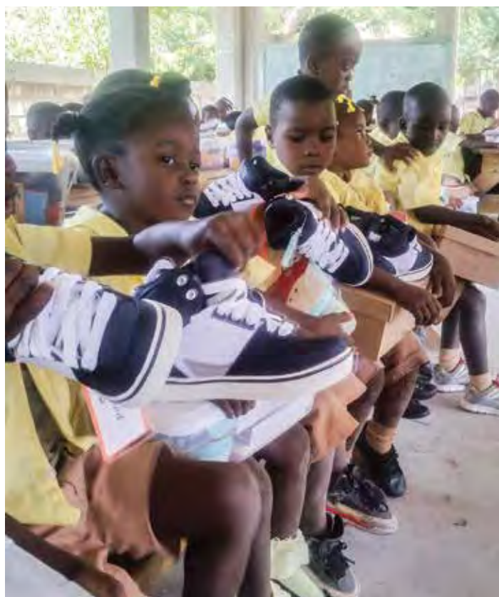
The children of Decouze, Haiti, enjoyed receiving new pairs of sneakers. Get involved at GiveSneakers.com