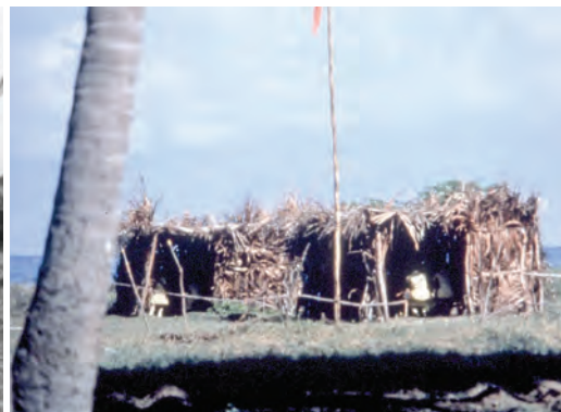
Top: Pioneering our mission in tents set the stage for us to live locally where the mission would serve.