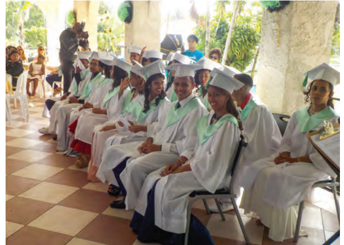
Congratulations to the Colegio Nueva Vida class of 2018! We celebrate with you as you enter this new season of life.