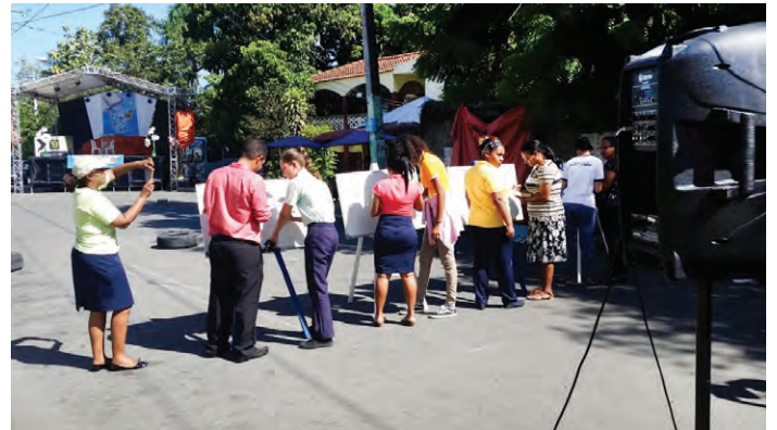
We are proud of our high school students who participated in a regional Bible competition against 22 schools—and won first place!