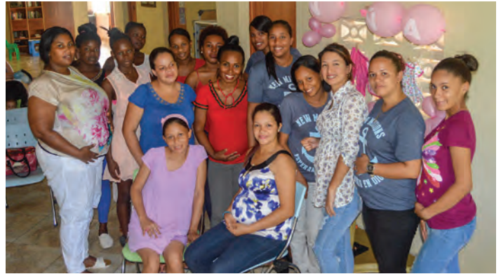
We are loving moms and celebrating life together at our Health Center in Sosua.