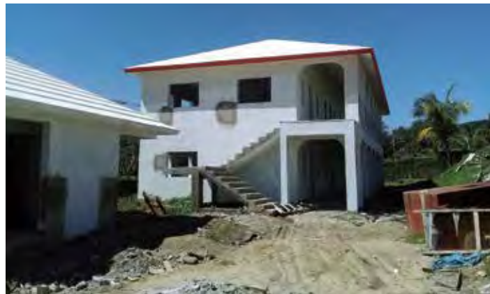
The new school building in Los Castillos, Dominican Republic, will be ready for this fall.