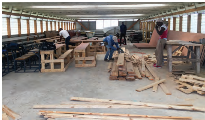
Classroom desks are 100% made at our mission in Haiti.