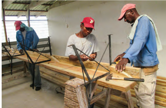
Employing Haitians to build desks supports the local economy.