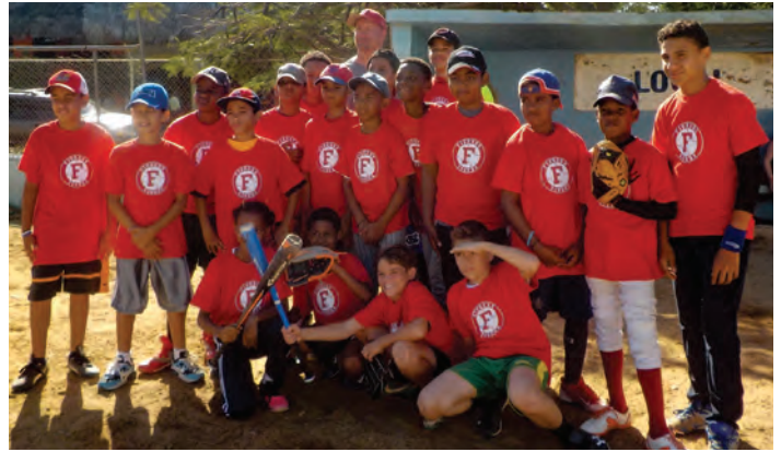
Baseball is a beloved sport in the Dominican Republic, and this baseball camp touched lives with the Gospel message.