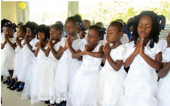
Kindergarten students from our New Missions Christian Academy in TiBoukan, Haiti, prayed before their graduation ceremony.