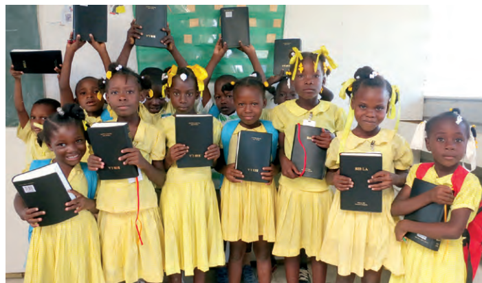
Giving our students Bibles is vital for their spiritual growth.