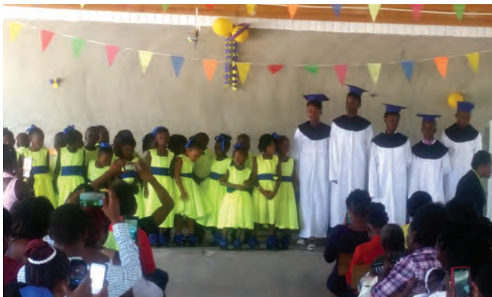
We celebrate kindergarten, sixth grade, and high school graduations at all our schools.