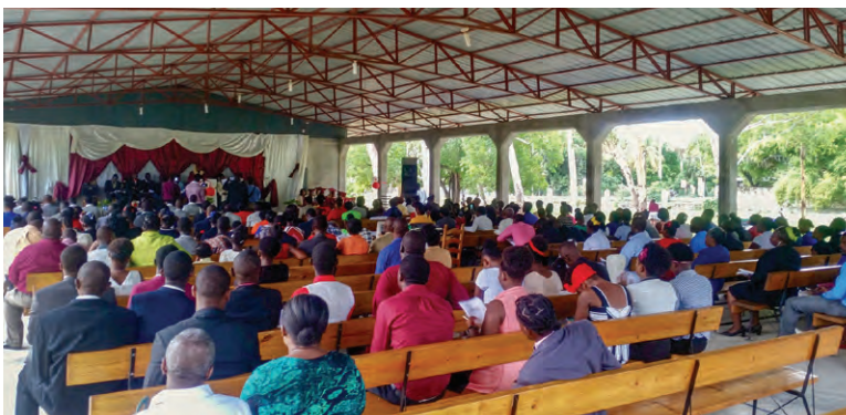
Top: Our Bible college graduates are surrendering their lives to ministry. Bottom left: Bible college graduation is a milestone...a true accomplishment. Bottom right: Our vision will outlast us as new Christian leaders rise up.