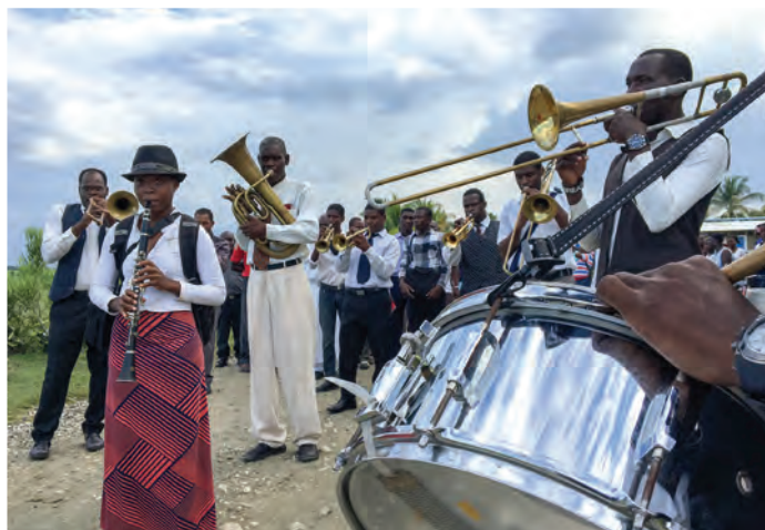
Bottom right: With a marching band leading the way, we walked to the ocean for the water baptism.