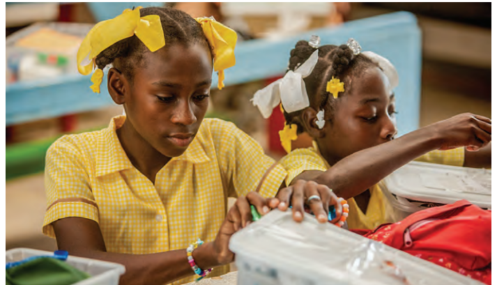
Your love and prayers matter so much to our students during the Shoebox Drive.