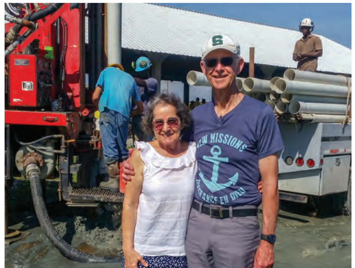
Middle: We were blessed with a new well at our Bire church, school, and medical clinic campus.