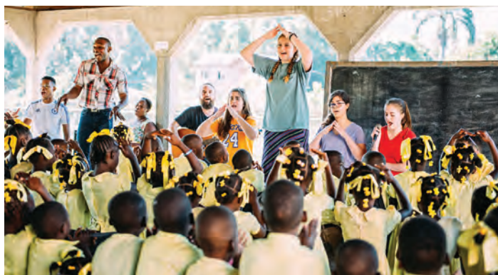
Thank you to students from Ben Lippen school—who shared VBS programs at our Masson, Signeau and Concrab Christian Academy campuses.