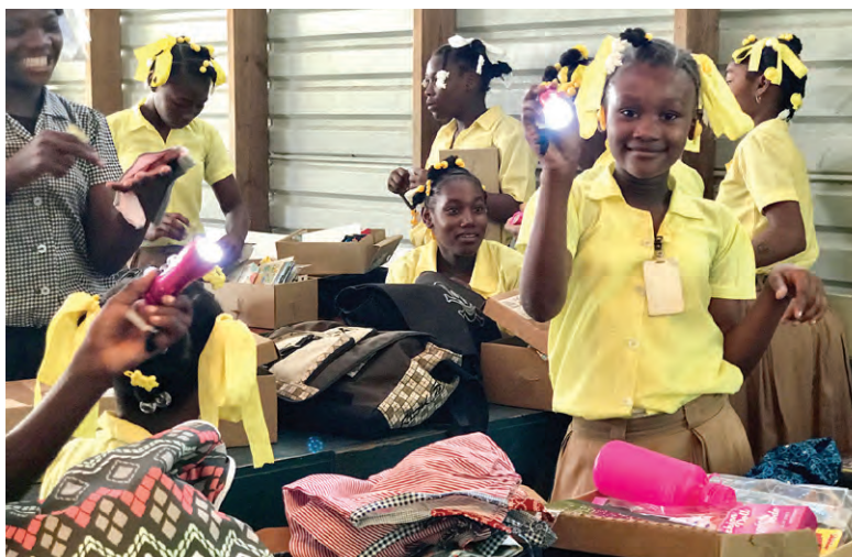
Middle: Thank you for putting smiles on faces and filling hearts with love.