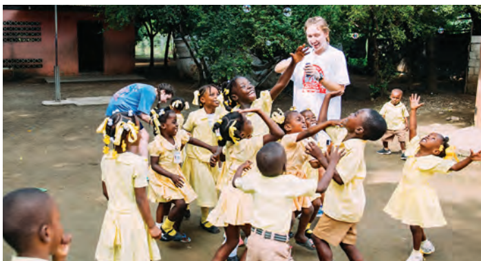
When students spend fun time together, hearts are encouraged. Love speaks every language.