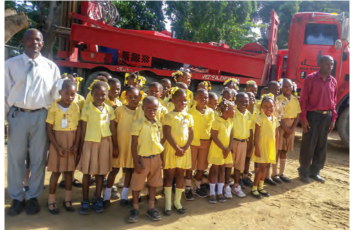
Students at our Masson Christian Academy prayed together prior to the well drilling.