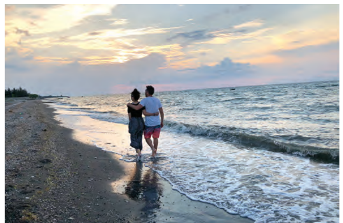
Bottom right: God made Haiti beautiful! A father and daughter making a lifetime memory visiting Haiti.