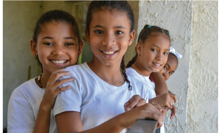
Students enjoy watching the construction and are very excited to use the new metal pavilion for chapel services and activities.