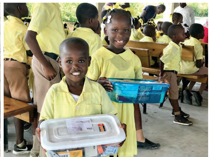
Bottom right: Because of you and your generosity, each student at our schools in Haiti will receive a shoebox gift.