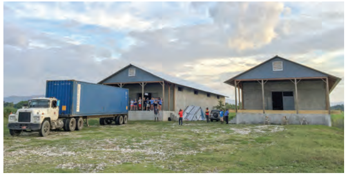
Thanks to your generosity, shoeboxes arrived at our warehouses in Haiti via cargo containers.