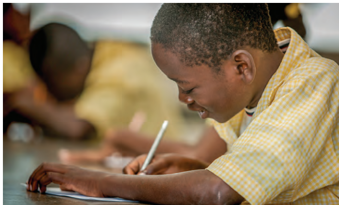
Your letters become the most prized possessions for the children.