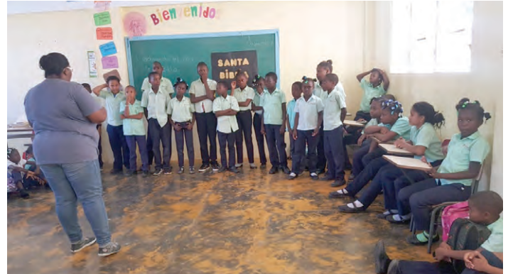
Students from our school in Redemption Village celebrated National Bible Month by singing songs and reciting Bible verses they had memorized.