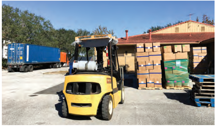
Each shoebox matters because each child matters to God.

Our students wait with anticipation for the arrival of the containers full of gifts. The fun begins when the boxes are distributed and the Gospel message is shared. Some children wait to open their shoebox at home—so they can open their gifts with their family, while others open them immediately. Your generosity makes it possible for children in Haiti to receive a tangible gift that shows the love of Christ. Lives are being changed because of your kindness. Please save the date for our next Christmas Shoebox Drive: Oct. 1 through Dec. 31, 2018.