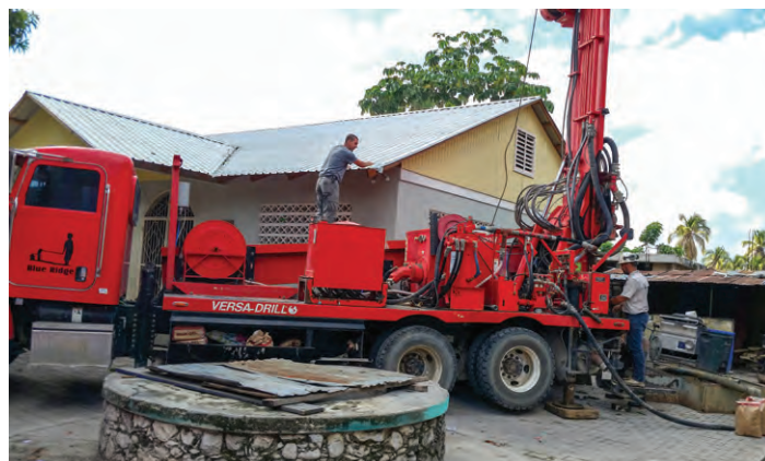
Our church and school in the town of Leogane, Haiti, has received a well as a testimony of God's provision.