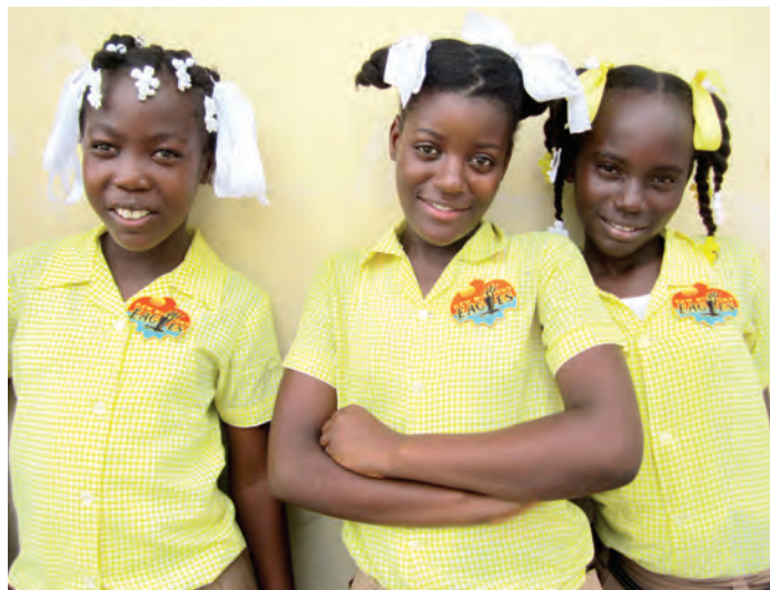
Go New Missions Eagles! Together, we are raising the next generation of Christian leaders.