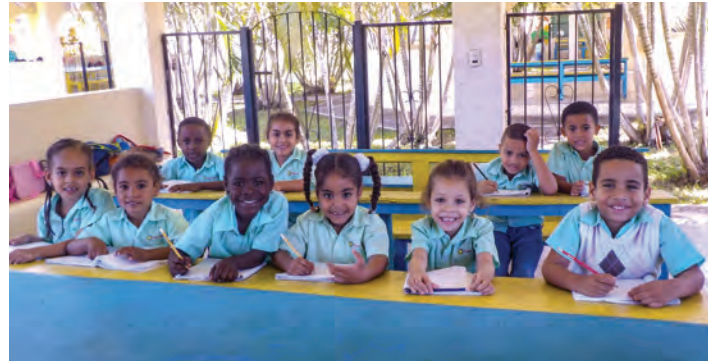
We are changing lives because each child matters to God.