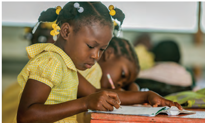
Thank you for writing to your sponsored child and sending prayers of encouragement.