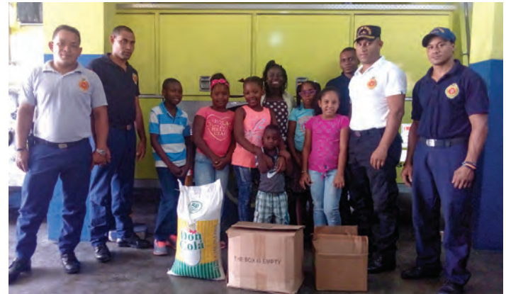
The children visited the fire station and presented the food gifts to the firemen.