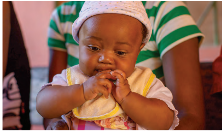
Plan now to pack shoebox gifts for our students and babies: October 1 through December 31.