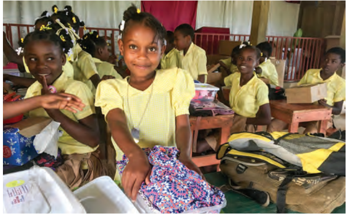
Thank you for your shoebox gifts going home with children to bless their entire family.