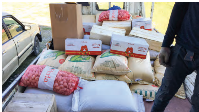
Monthly, food is distributed to each school campus for the students' daily meals.