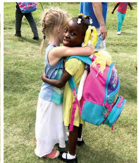
Bottom right: When you sponsor a child, your life is changed forever, too.