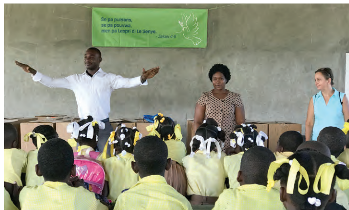
Our New Missions Christian Academy theme verse for this year is found in Zechariah 4:6-7.