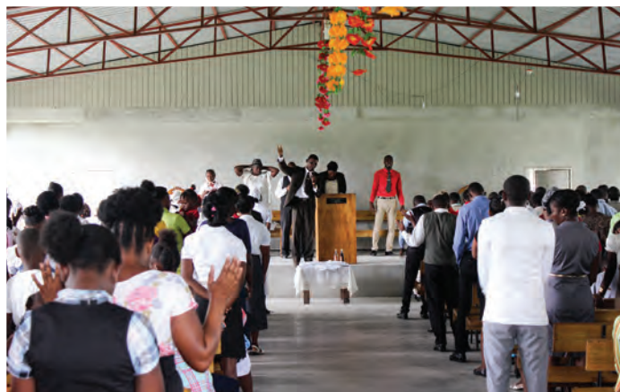
Middle: Together, we are giving generously, because we steward what's not ours.