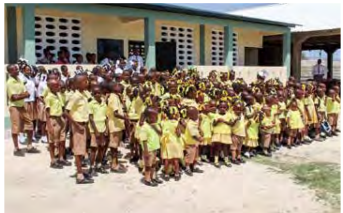
Middle: The tenth church at New Missions has been located in Leogane, Haiti, since 1989.