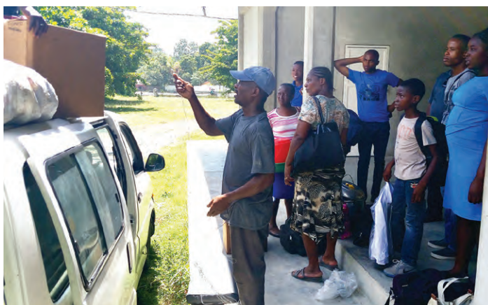
Thank you for praying for Haitians from our churches on mission trips across Haiti.