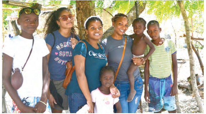
The leadership visited families in the community and invited the children to Vacation Bible School.