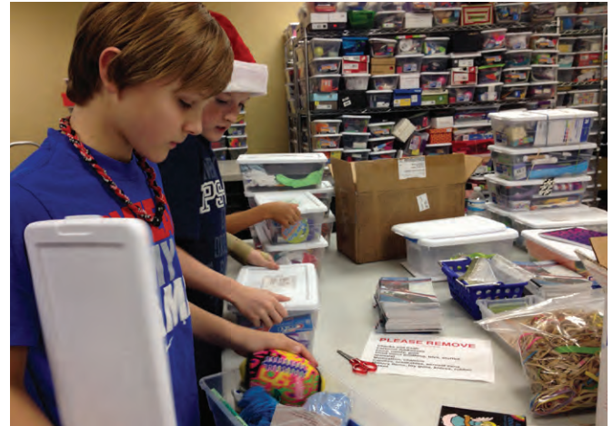
We are thankful for volunteers of all ages who serve during our Shoebox Drive.