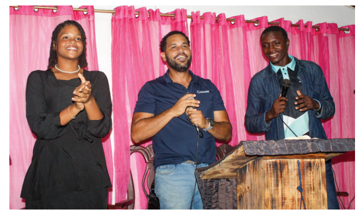
The youth led worship in Spanish and Creole at a church service they attended while on a mission trip.