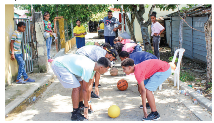
The youth enjoyed planning activities to do with the children when they were on their mission trip in Jarabacoa.