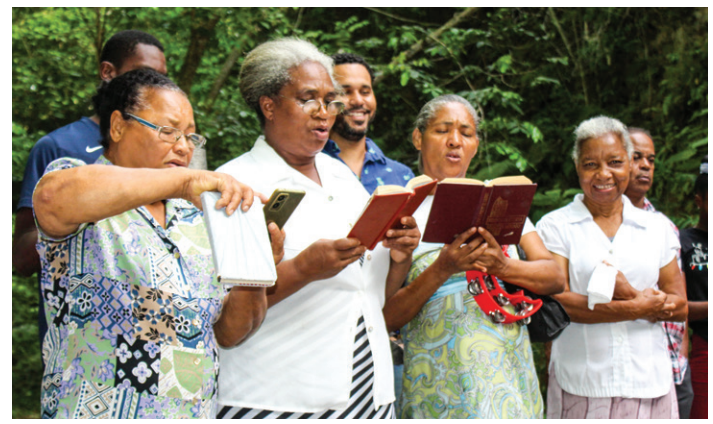
The baptisms were a highlight for all church members. Here, some of them are singing and worshipping during the baptisms.