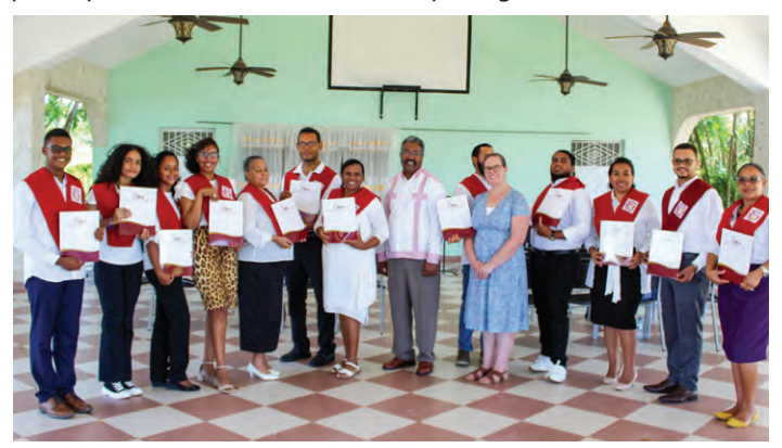
Everyone who took the class thoroughly enjoyed it and learned a lot about how to interpret the Bible.