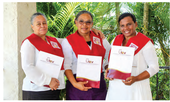
A special award ceremony was planned to present each participant with a certificate for completing the course.