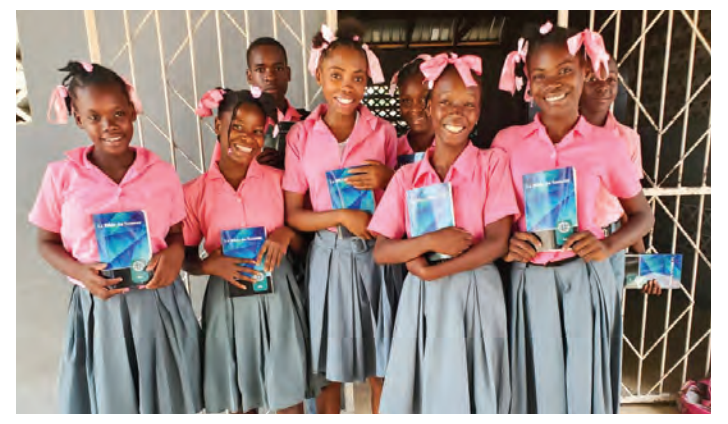
God's Word is powerful and changes lives! Leogane Middle School students are happy to have received a new Bible.