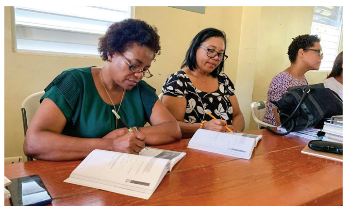
The ladies met weekly for discussion and a video that prepared them for their next week of the study.