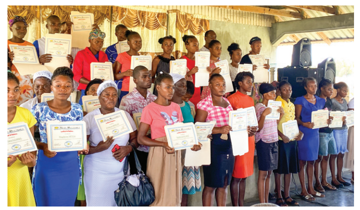
The 38 who were baptized came from 10 of our campuses. Preaching the Gospel remains our number one priority.