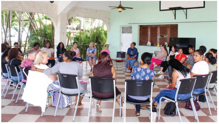
The Bible study started with a one-day retreat where we talked about spiritual warfare and the armor of God.