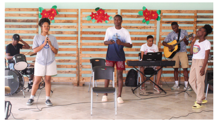
The worship team is very dedicated and practices for hours every Saturday to prepare for the service on Sunday.