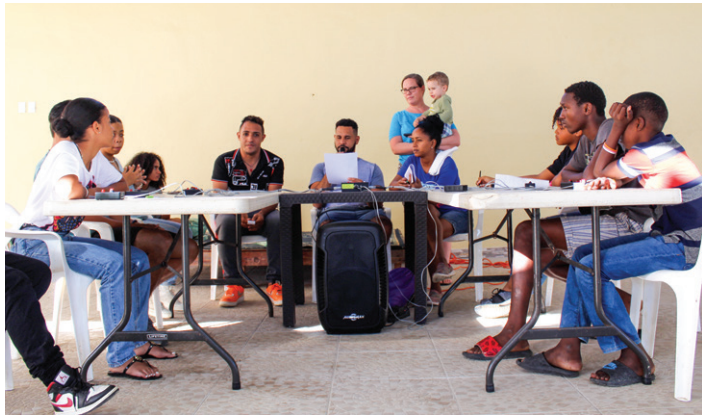
We have multiple rounds of two teams competing against each other to win the prize in the final competition.