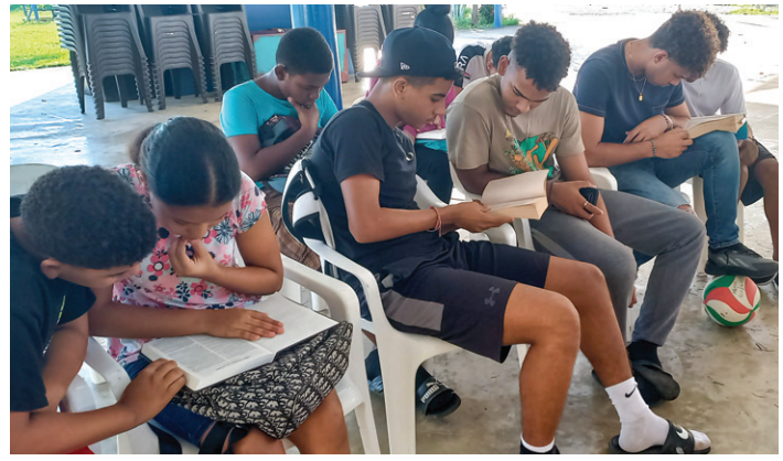
Some of the youth in Playa Chiquita studying the book of Genesis to prepare for a Bible memory competition.