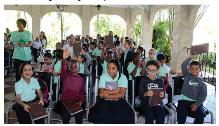
After a special presentation for the students, the Leaders for Christ group distributed Bibles to every student.