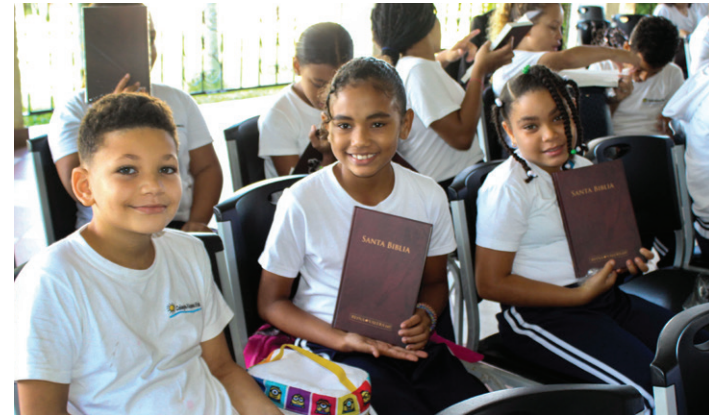
The students were so happy to receive their very own Bible; many started reading them right away.