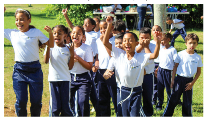
Students cheering on their teammates as they play outside during a recent school day at Colegio Nueva Vida.