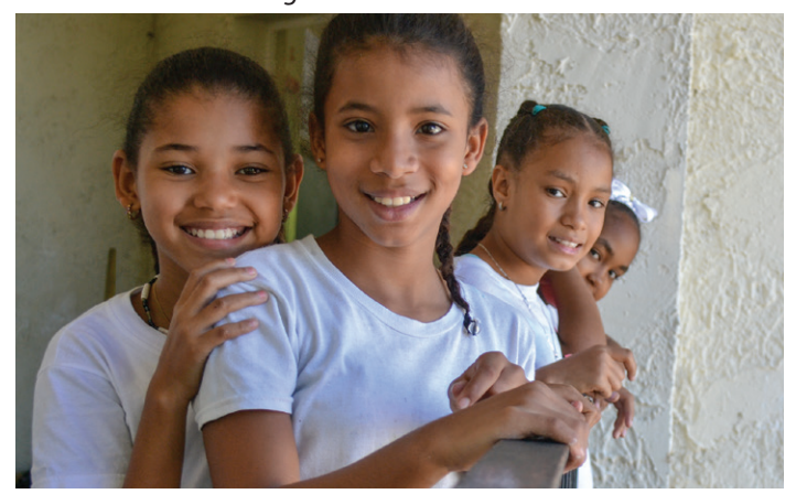
Students enjoy watching the construction and are very excited to use the new metal pavilion for chapel services and activities.