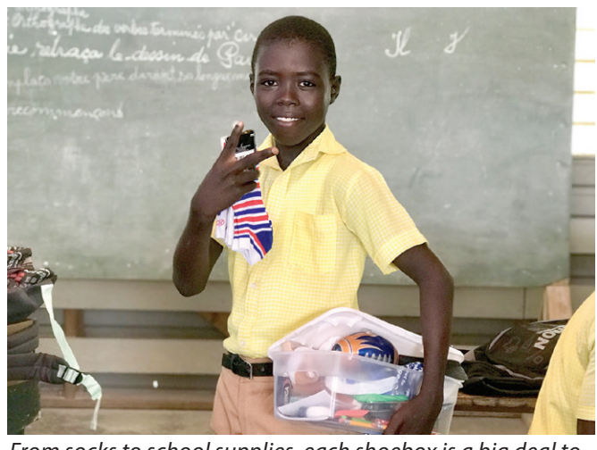
From socks to school supplies, each shoebox is a big deal to our students.