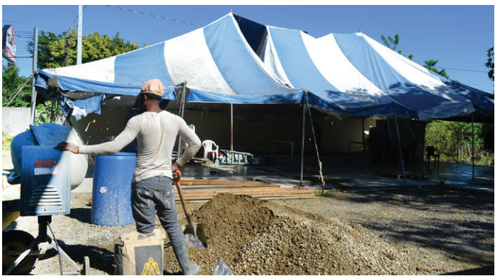
Workers are laboring six days a week to finish the pavilion before Christmas activities begin.