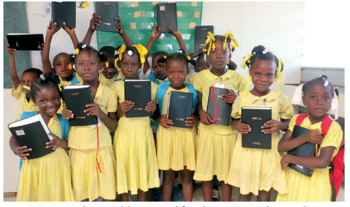
Giving our students Bibles is vital for their spiritual growth.